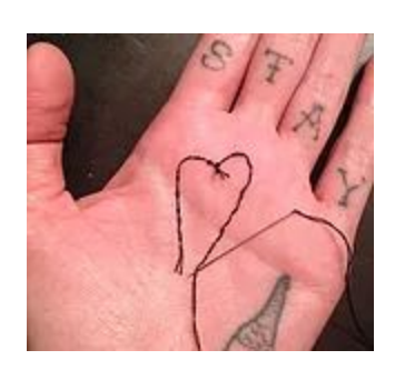
Wound Dwelling: Writing and Stitching the Survivor Body(ies) Fall 2016 Jennifer Patterson

What is the physicality of a wound? What types of loss feel nearly impossible to come back from? Can we dive into the wound, the loss: excavate and unearth it? In this class we will focus on survival and survivorhood; what it looks and feels like to live beyond traumatic experiences. The dominant narratives about the survivor body(ies)— oft pathologized as disembodied, disassociated and unwell— will be turned on their heads. We can never actually leave our bodies, as hard as we might try (and as wise as we are in our reasons for trying) and are therefore always already embodied. Too often survivors that are also writers are told to not dwell in the trauma, that writing from personal and traumatic experience isn't "legitimate" writing.