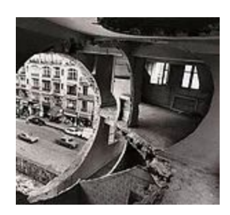
Taking Buildings Down Fall 2015 David Bench

This course is to look critically at the built environment in our landscape as it relates to economic and power dynamics of development. Through successful grassroots efforts largely in the 1960s, community activists have a role to play in preserving existing buildings, structures, and landscapes through a Landmarking process. Now in its 50th year in NYC, this program has successfully saved many unique buildings from over-development. This class is proposed to explore a corollary development process in which citizens can propose buildings and infrastructure to remove- as removal is currently only achieved in the expectation of some replacement as proposed by a developer or government agency. Can removal be a design decision? Aren't some structures better of removed? How does this concept get incorporated into a community dialogue?