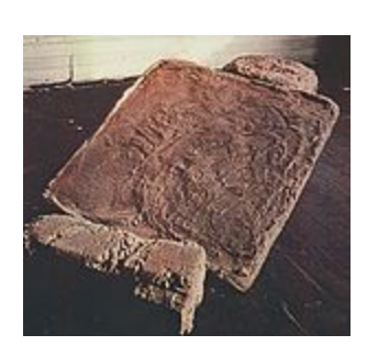
Race, Gender, Land Art Fall 2014 Park McArthur

As urban unrest accelerated in accordance with domestic public policy or lack thereof, American artists began developing a movement in the 1960s and 70s now known as Land Art. This turning towards geology and nature, though not without a certain social conservatism and escapism, also provided women and artists of color spaces of critique through the construction of outdoor memorials, mounds, and living fields. In addition to permits and rights of use, an earthwork often requires the work of many people to accomplish. As such, Land Art is highly administrative.