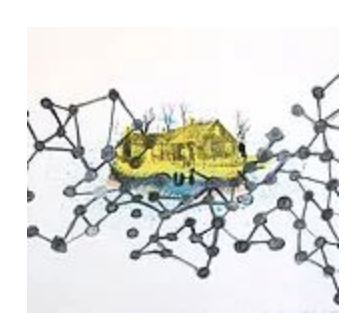
Drawing and Knowledge Fall 2016 Christine Garvey

In this 8 session course, students will explore the practice of drawing as a powerful language of questioning. We will locate this investigation within art history, looking at drawing's heritage as a tool to examine, critique, appreciate and order our perceivable world, and in doing so, create space for something wholly new. Class presentations and studio-based projects will introduce students to drawing's deeply interdisciplinary significance as a medium: from the first recorded marks of cave paintings, to Galileo's drawings of the moon, these examples and others will help us consider the uniquely human impulse to draw what we perceive, and the meaningful questions that lay at the heart of our creative practices.