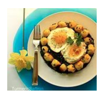
Cooking Creativity: The Egg Spring 2014 Kouri Killmeier & Julie Edwards

This workshop will start with each participant taking on a specific role in the kitchen assigned by Chef Kouri Killmeier as we focus on one simple ingredient, the egg, an ingredient inspired by the limitless directions all art forms can take. The humble egg can be transformed into an endless array of edible masterpieces from its most simple form dancing in a pot of boiling water to a stunning display of glossy whipped meringues and the never disappointing sultry texture of a perfectly prepared creme brûlée.