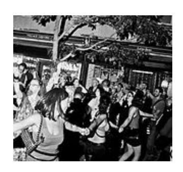
JUST LIKE THAT: Embodied Knowledge and Political Movement