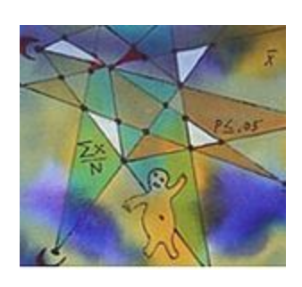
Self Analysis Through Statistics: Attempting the Impossible